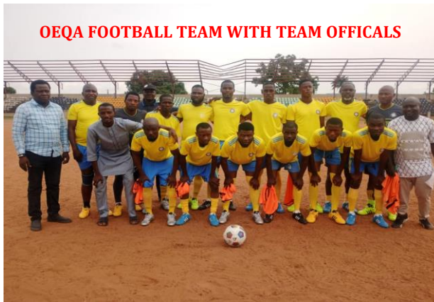
OEQA FOOTBALL TEAM WITH TEAM OFFICIALS