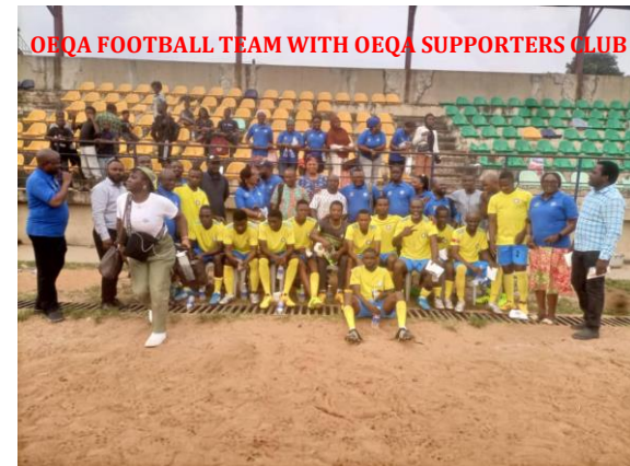
OEQA FOOTBALL TEAM WITH OEQA SUPPORTERS CLUB

OEQA 1 st MATCH: Thursday, 29th August, 2024 @ Rehabilitation Center, Ojodu Berger