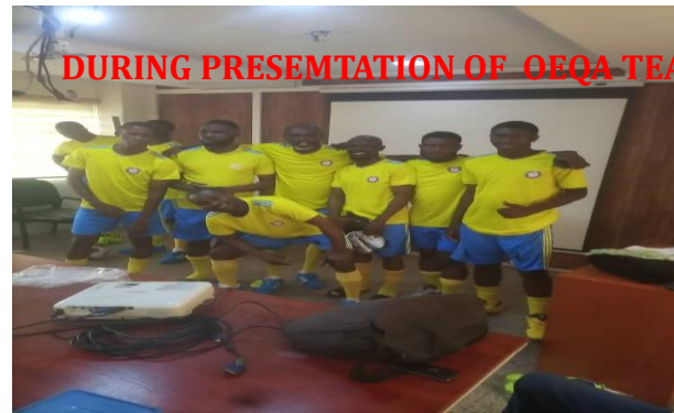
DURING PRESENTATION OF OEQA TEAM TO THE MANAGEMENT OF OEQA