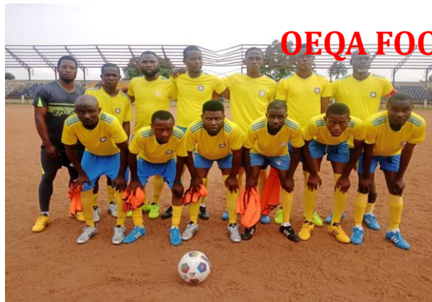
OEQA FOOTBALL TEAM